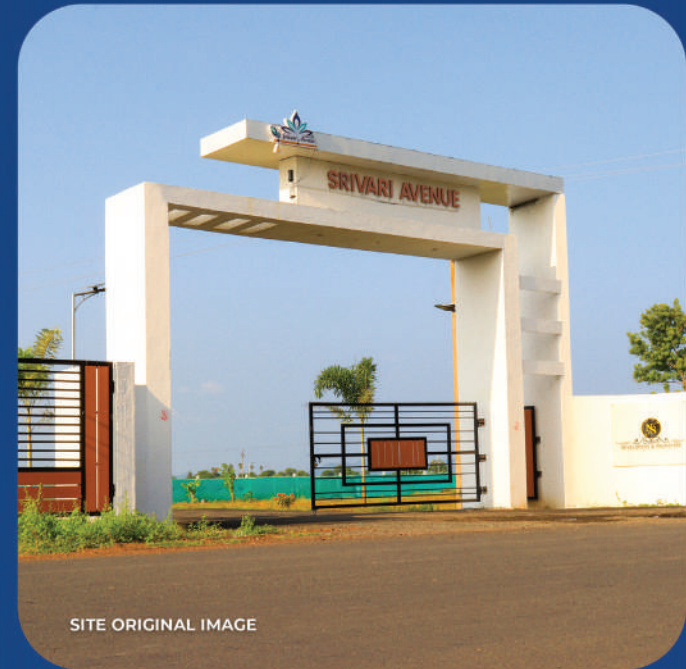
SITE ORIGINAL IMAGE