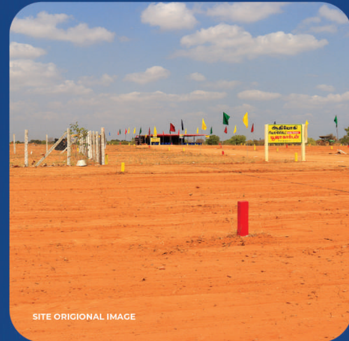
SITE ORIGINAL IMAGE